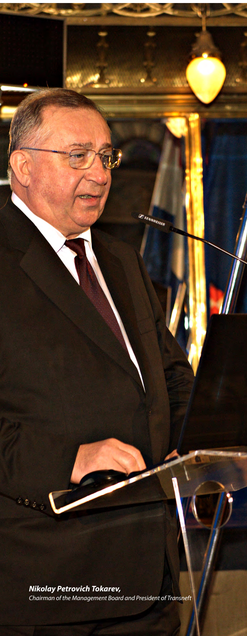
Nikolay Petrovich Tokarev, Chairman of the Management Board and President of Transneft

It is my great pleasure that I can welcome you, on behalf of Transneft, on this year JANAF's conference in Zagreb.